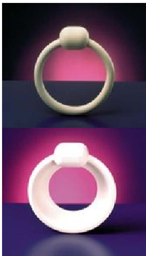
Fig. 1 Incontinence ring and incontinence dish

the increased outside diameter produced by the knob on the incontinence ring or dish.